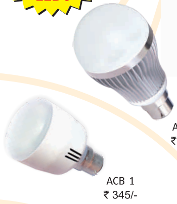
ACB 1 ₹ 345/-