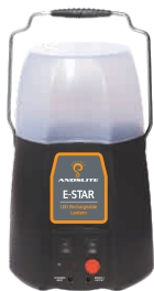
E-STAR ₹ 2995/-