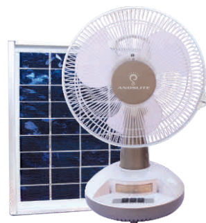
ELEGANT SOLAR (Solar Table Fan) ₹ 3950/-