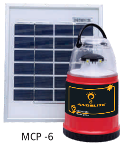
MCP -6 ₹ 1495/-