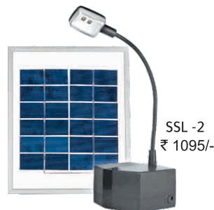
SSL -2 ₹ 1095/-