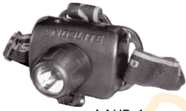
AAHR 1 ₹ 195/-