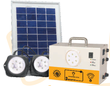
SHL - 1 ₹ 3995/-