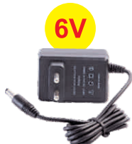
6V BC 6 ₹ 175/-