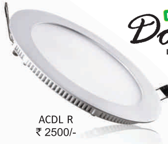
ACDL R ₹ 2500/-