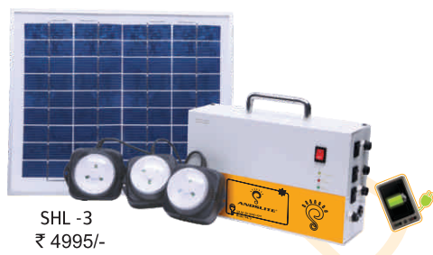
SHL - 3 ₹ 4995/-