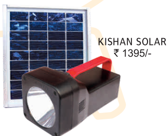
KISHAN SOLAR ₹ 1395/-