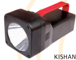
KISHAN ₹ 995/-