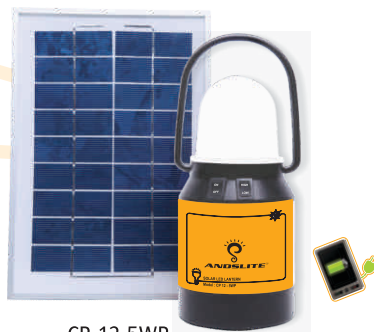
CP 12-5WP ₹ 2295/-