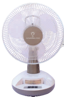
ELEGANT (Rechargeable Table Fan) ₹ 3495/-