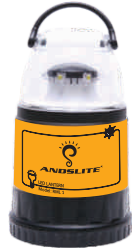
RML - 1 ₹ 995/-