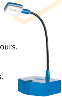
STLP 2 ₹ 495/-