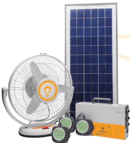
SHL - 4 (20W Panel) ₹ 7995/-