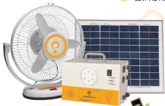
SFL - 1 ₹ 4195/-