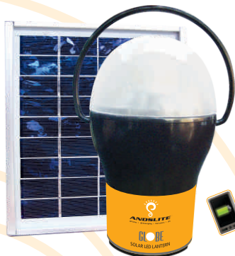
GLOBE ₹ 1750/-