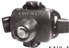
AAHL 1 ₹ 195/-