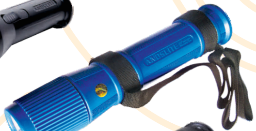
DBR 1 ₹ 290/-