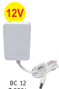
12V BC 12 ₹ 250/-