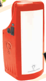
VENUS ₹ 1295/-