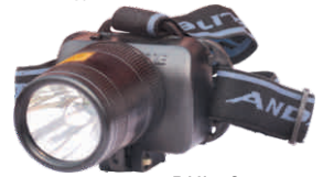
RHL -2 ₹ 799/-