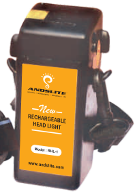
RHL -1 ₹ 725/-