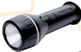
DBEX 2 ₹ 245/-