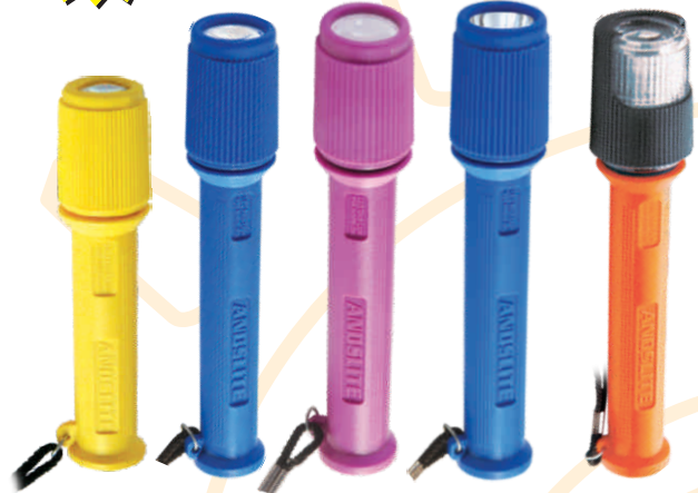
AASL 0 ₹ 60/-