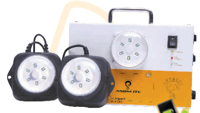
LHL - 1 ₹ 3295/-