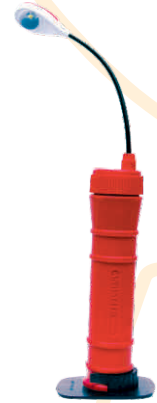
STLPN 1 ₹ 285/-