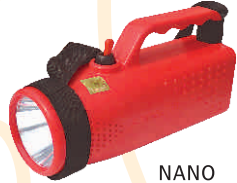
NANO ₹ 845/-