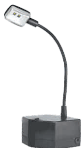
RSL - 2 ₹ 725/-