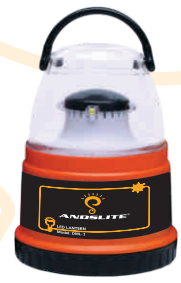
DML-1 ₹ 495/-