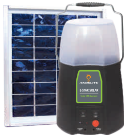
E-STAR SOLAR ₹ 3295/-