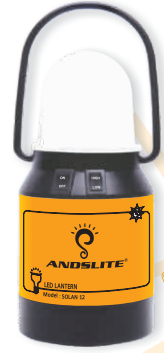
SOLAN 12 ₹ 1545/-