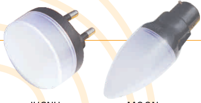
JUGNU ₹ 69/-