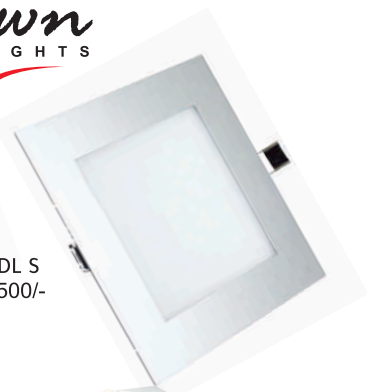
ACDL S ₹ 2500/-