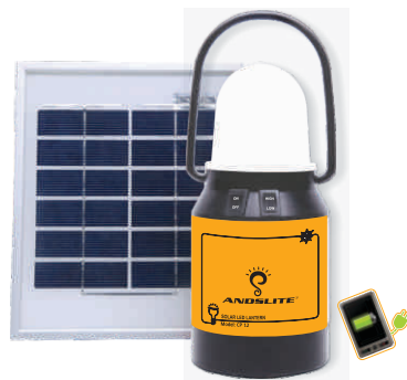
CP 12-3WP ₹ 1995/-