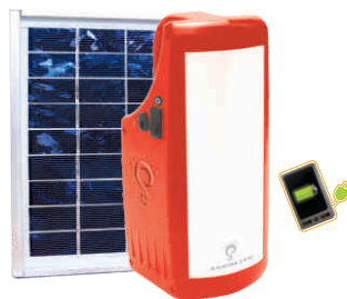
VENUS SOLAR ₹ 1695/-