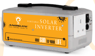
PORTABLE SOLAR INVERTER ₹ 29,500/-