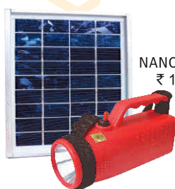
NANO SOLAR ₹ 1245/-